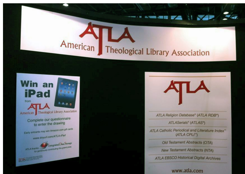
ATLA booth at AAR & SBL Annual Meetings