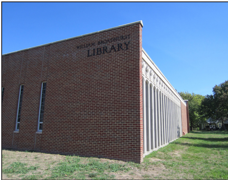
The William Broadhurst Library at Nazarene Theological Seminary