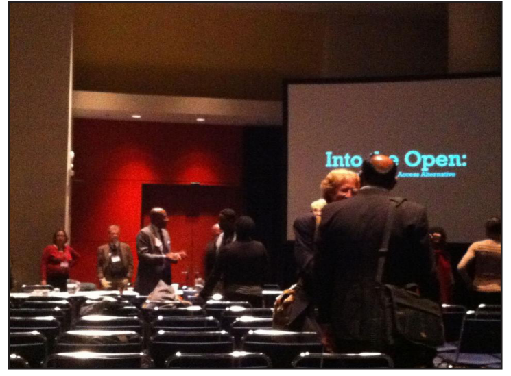
Theological Librarianship at "Into the Open: Exploring the Open Access Alternative" at the 2012 AAR and SBL Annual Meetings.

The presentation covered a range of pertinent topics: What makes OA publishing attractive? What are the primary challenges or sources of resistance to shifting to OA? What basic infrastructure is