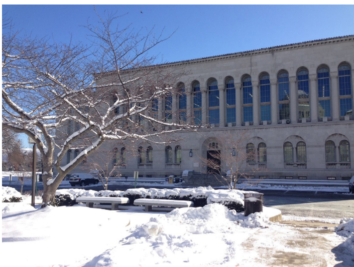
Institutional Member Catholic University of America, Mullen Library, Washington, D.C.