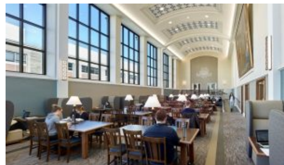
Falvey Memorial Library at Villanova University

Villanova University was founded in 1842 by the Order of Saint Augustine. There are more than 10,000 undergraduate, graduate and law students in the University's six colleges. The Falvey Memorial Library supports research, teaching, and learning at Villanova University. The Library's Special Collections houses approximately 15,000 items acquired through