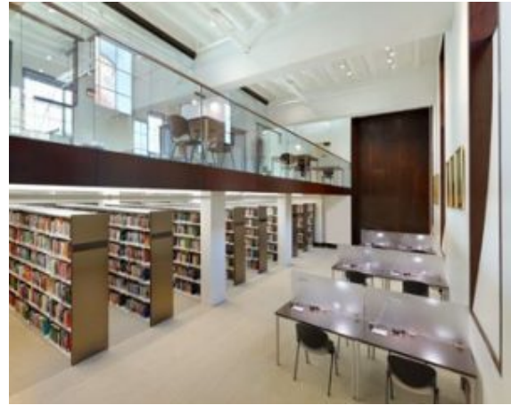
Souvay Library at Kenrick-Glennon Seminary