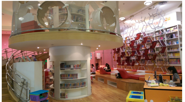
TKpark Library in Bangkok

Bangkok can obtain a day pass to browse materials, attend events in its theatre, and make use of the music library.