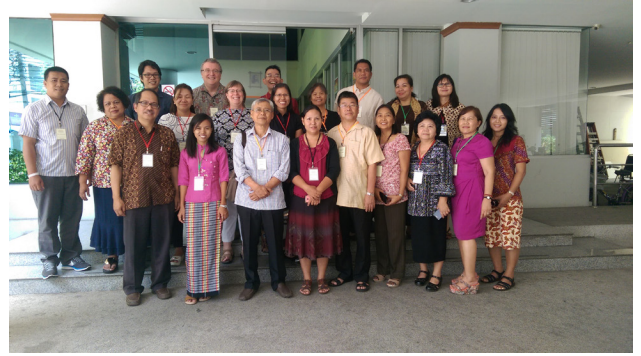
ForATL Meeting, Bangkok Christian Guest House, Bangkok, Thailand, May 1-4

The group took time out from discussing theological librarianship to tour the Thailand Knowledge Park Library (referred to "TKpark") housed in the CenterWorld Mall. This inviting state of the art library is located on the 8th floor of an enormous mall. Visitors from outside