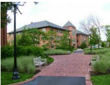
North Park University, Johnson Center for Science and Community Life, Chicago.

On Friday, April 24, I had the distinct honor of attending Chicago Area Theological Library Association's (CATLA) meeting honoring the 50th anniversary of the founding of the organization. The presentations, which primarily focused on the history of specific institutions or the contributions of significant institutions, were a great introduction for a newcomer.