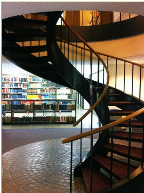
Bethel Seminary Library, St. Paul, MN

This site includes lists of interest, restaurants, and drug stores. You can also use the interactive Google map!