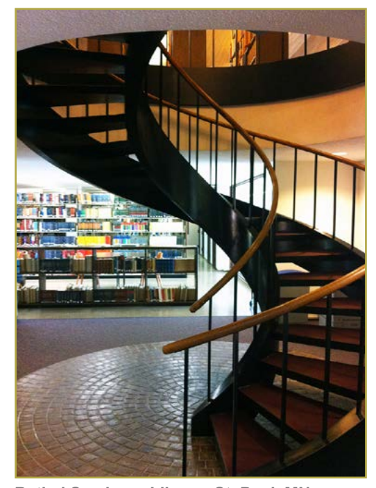
Bethel Seminary Library, St. Paul, MN

This site includes lists of interest, restaurants, and drug stores. You can also use the interactive Google map!