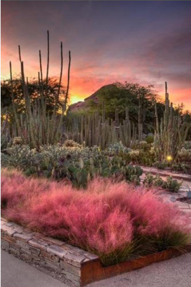
A Desert Botanical Garden sunset in Phoenix, Arizona.