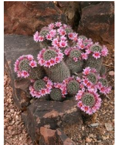
"Arizona Pincushion"