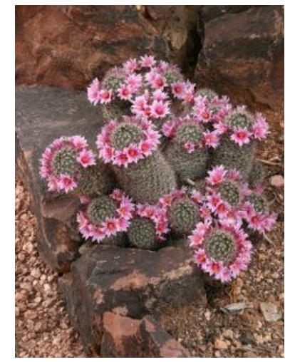
"Arizona Pincushion"