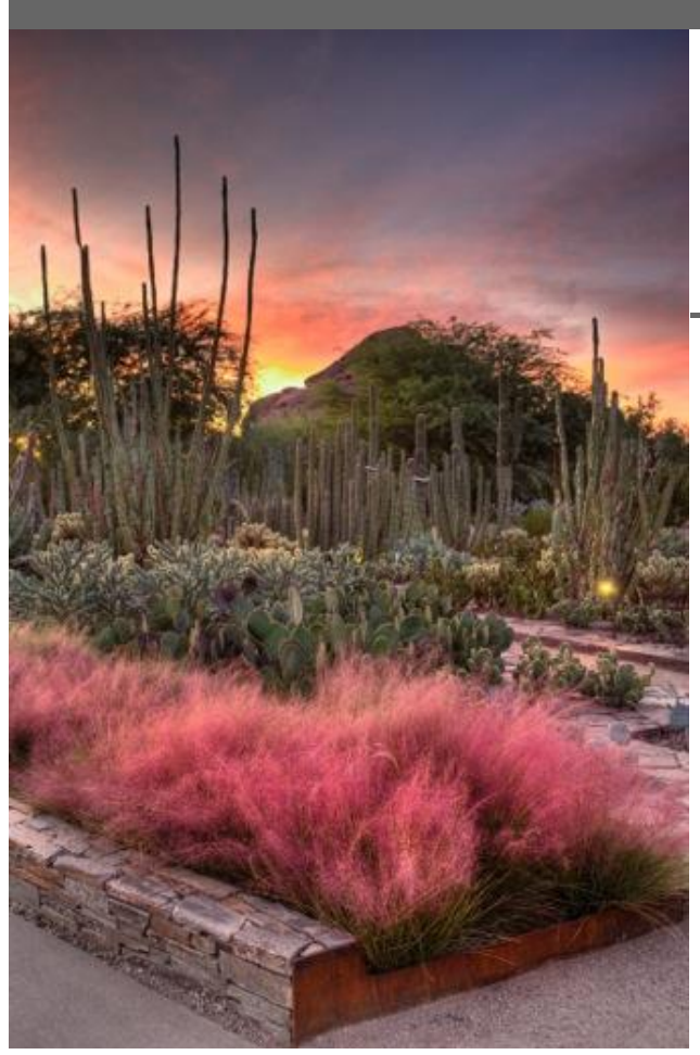
A Desert Botanical Garden sunset in Phoenix, Arizona.