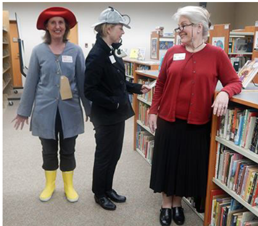
Institutional Member Mercer University, Swilley Library, Atlanta, GA, celebrates National Library Week with Paddington Bear, Sherlock Holmes, and Miss Marple.