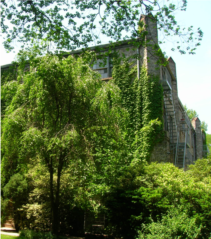
General Theological Seminary.