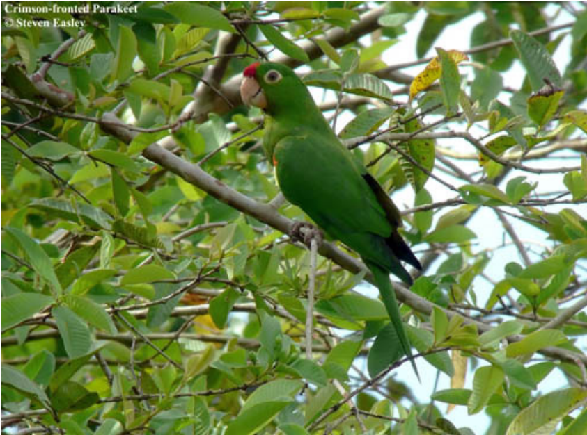
Above: Crimson-fronted Parakeet

development policy based on curriculum support and use it as a means of determining which books ought to receive priority in cataloging. While we were examining the books in the backlog, we heard a squawk, turned around, and saw a Crimson-fronted Parakeet with its beak pressed against the window. This I took to be a positive omen (for me, at least).