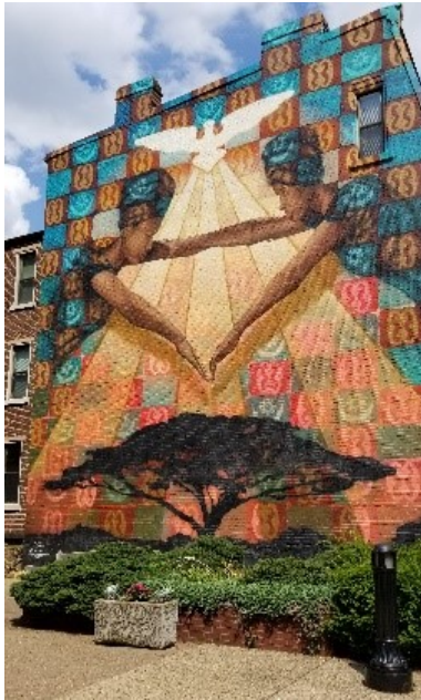
Spiritan Mural, Duquesne University