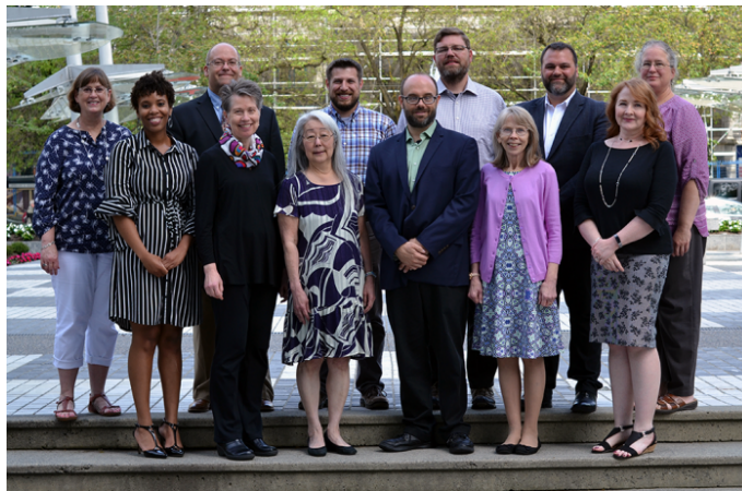
The Board of Directors for 2019-2020.

The Finance Committee proposed a revision to the Investment Policy (EL2) to include a statement about the ability to respond to changing opportunities. The Finance Committee is beginning the process of selecting a new audit firm for the Association.