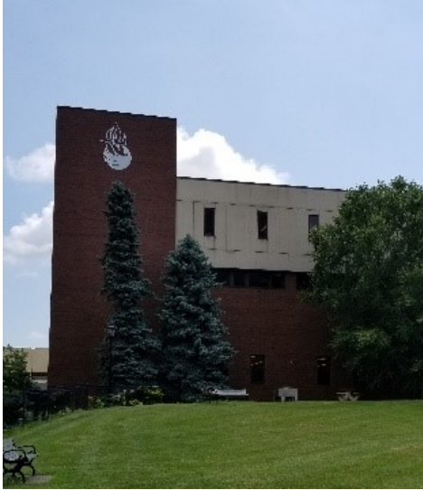
The exterior of Gumberg Library, Duquesne University