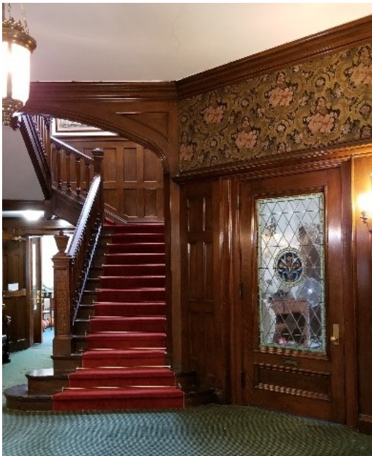
Interior of the Reformed Presbyterian Theological Seminary – embossed wallpaper discovered beneath layers of paint.

What fascinated me most about the interior of the seminary, was the beautiful embossed wallpaper that had been discovered beneath layers of paint. Thankfully, workers were able to carefully remove the paint to reveal the gorgeous print beneath.