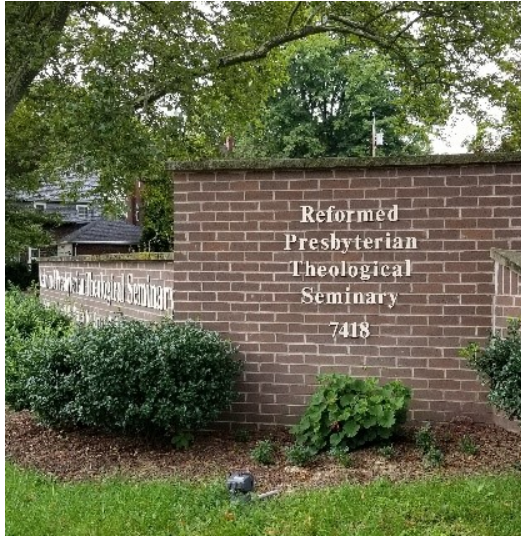
Entrance to the Reformed Presbyterian Theological Seminary

I started my day at Reformed Presbyterian Theological Seminary < https://rptslibrary.org/ >, one of the oldest seminaries in the United States. Located adjacent to the national headquarters of the Reformed Presbyterian Church of North America, the seminary offers students three degree programs: MDiv, MTS, and DMin.