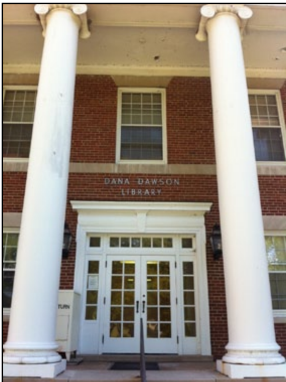
The Dana Dawson Library at Saint Paul School of Theology

Membership in the ETIG and all other ATLA Interest Groups is open to all individual, lifetime and student members of the Association. To learn more about the group and other ATLA Interest Groups, please visit the ATLA Interest Groups page .