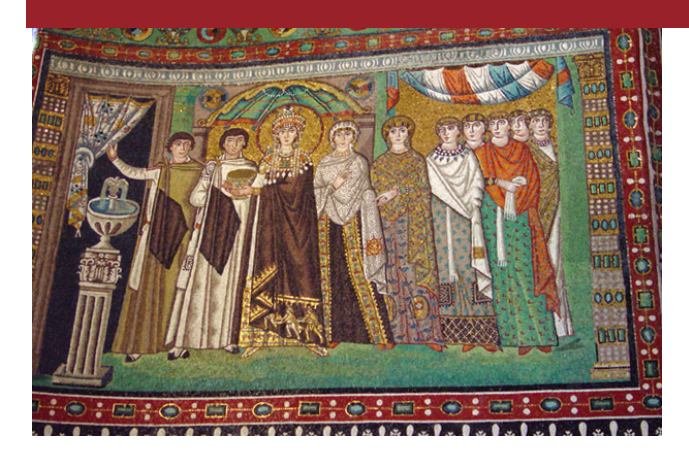
San Vitale, Ravenna, Italy - Empress Theodora Offering the Cup of the Eucharist--Images of Religious and Theological Iconography (available on ATLA's CDRI database).