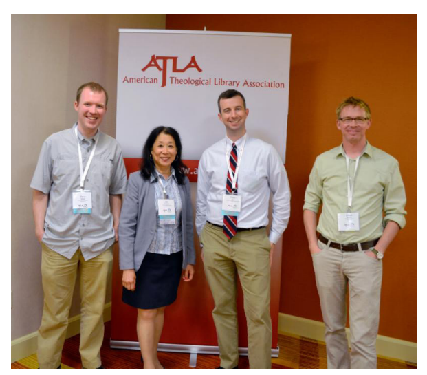
Bingo Winners at the President's Welcome Reception for New Members and First-Time Attendees at the 2015 ATLA Annual Conference. See more Conference Photos.