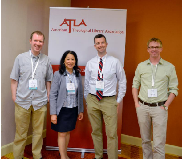
Bingo Winners at the President's Welcome Reception for New Members and First-Time Attendees at the 2015 ATLA Annual Conference. See more Conference Photos.