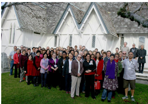
Attendees of ANZTLA 2015