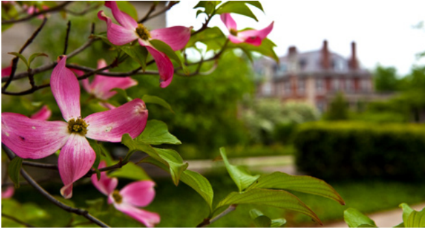
Above: A view from the grounds of Louisville Presbyterian Theological Seminary (LPTS).