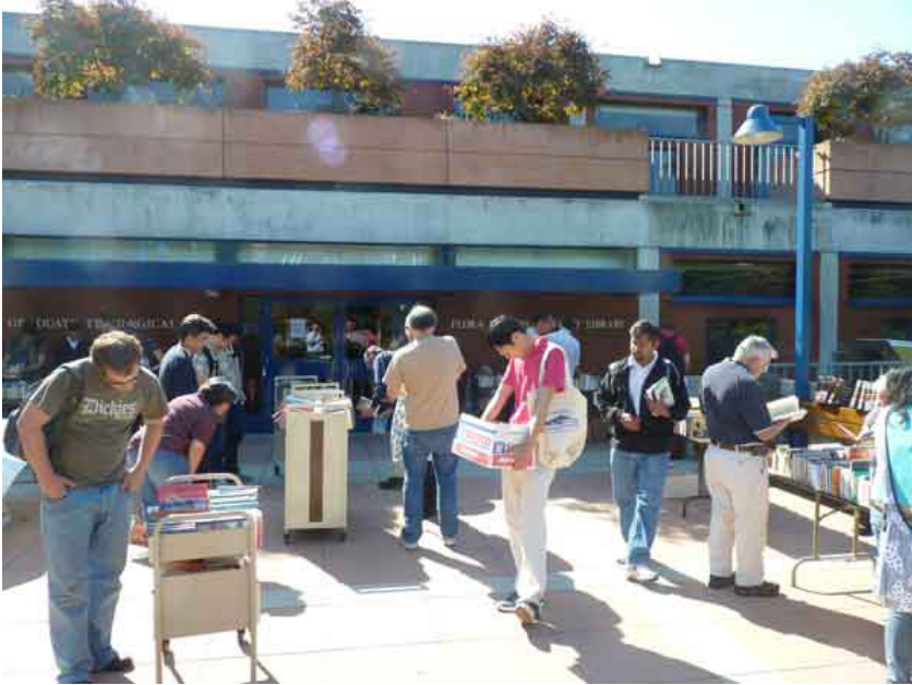
Scenes from TLM 2010: Patrons browsing at the Graduate Theological Union Library Book Sale.