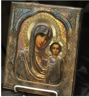
An icon on display at the Concordia Seminary Library.