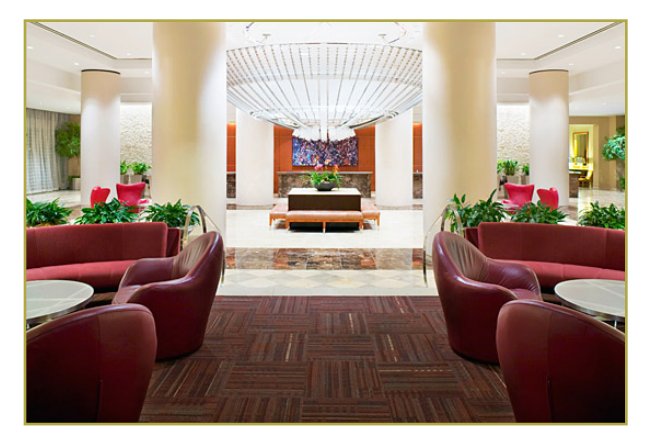
Reserve your Room Today This year's conference will be hosted downtown at The Westin Charlotte. Hotel rooms are offered at a discounted rate. <u>Reserve your room today</u>.

By indicating that you are attending, you can view up-to-date information and insider news through Facebook.