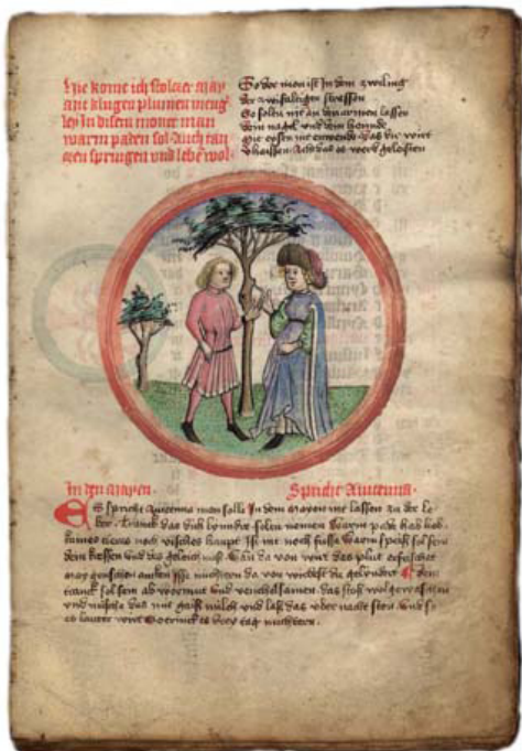
A young couple courts by a tree in this image from Medizinisch-Astrologisches Hausbuch from the collection at Concordia Seminary Library, St. Louis, MO.