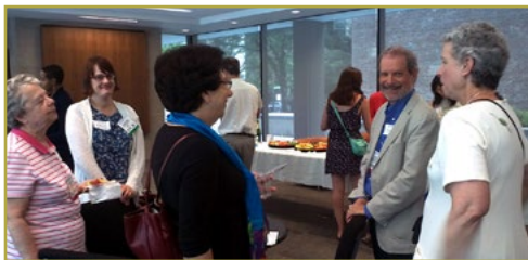
Guests enjoy conversation and kosher food at the ATLA, AJL, CLA Social Gathering.

ATLA partnered with the Association of Jewish Libraries (AJL) and the Catholic Library Association (CLA) to host a social gathering on Sunday, June 30, at the St. James Commons in downtown Chicago.