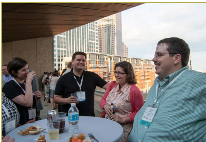
Members enjoying refreshments and conversations at the 2013 ATLA Annual Conference Reception in Charlotte, North Carolina.