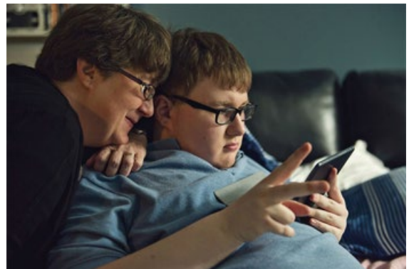
This photo was first published in Faith & Leadership.