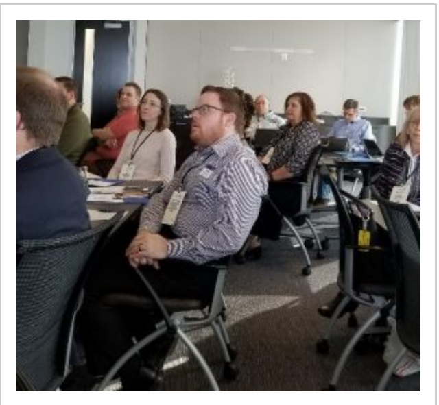
ATLA Members learn about scholarly communications issues such as copyright and open access at the ACRL Roadshow event.