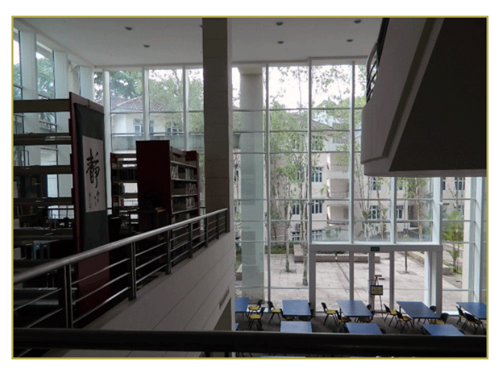
Trinity Theological College Library in Singapore