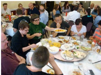
ATLA staff enjoying Lee Wing Wah