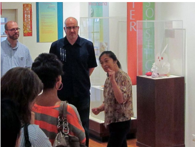
ATLA staff at the Chinese-American Museum