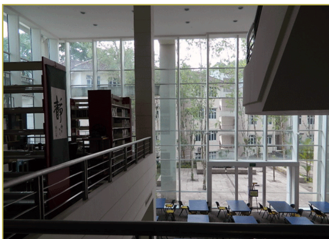
Trinity Theological College Library in Singapore