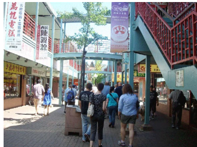
ATLA staff walking the streets of Chinatown