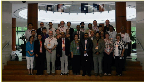
Attendees at the IFLA Satellite Meeting on LIS Education in Developing Countries.

During the coming year the International Collaboration Committee (ICC) will be considering what would truly help strengthen theological librarianship internationally. Many seminaries and theological schools are established in the majority world without a trained librarian on staff. A