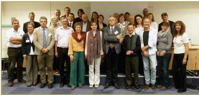
Bibliothèques Européennes de Théologie (BETH) members and official attendees visit Paris, France, September 11-15.