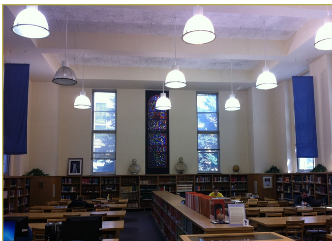
St. Paul Seminary - University of St. Thomas Archbishop Ireland Memorial Library St. Paul, Minnesota