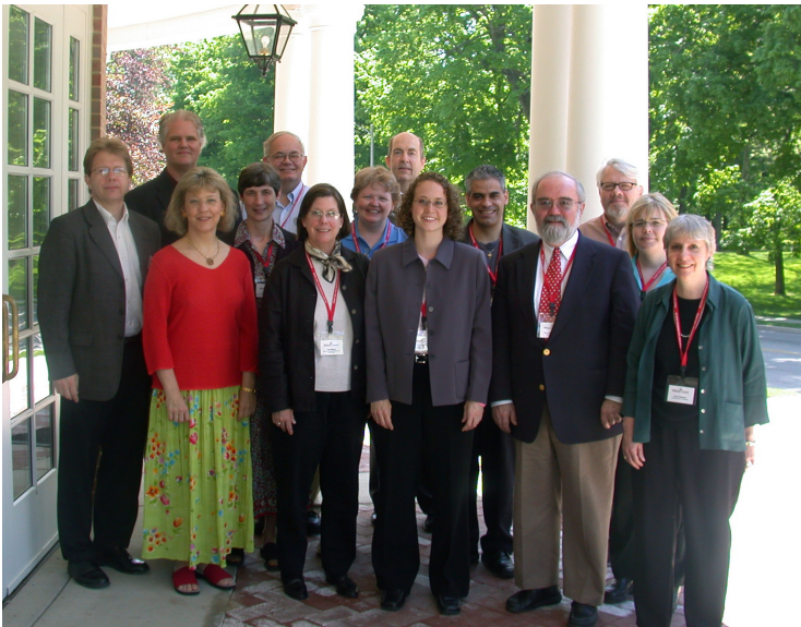
Participants and leaders in the 2005 Wabash Teaching and Learning Colloquy.