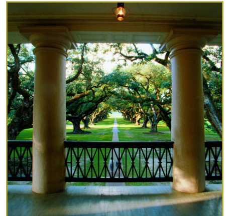
Oak Alley Plantation