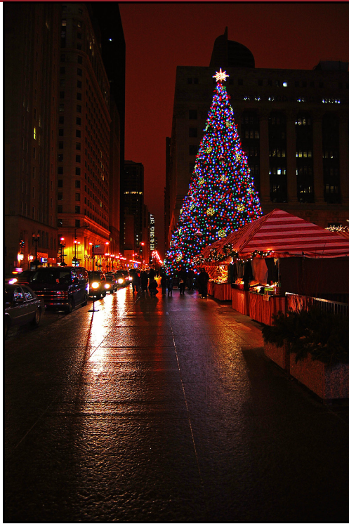
Happy Holidays from the 2011 Chicago Local Hosts. We are looking forward to welcoming you to our neighborhood in June.