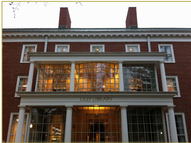
The Lilly Library at Wabash College (Crawfordsville, IN)