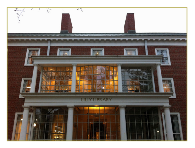
The Lilly Library at Wabash College (Crawfordsville, IN)