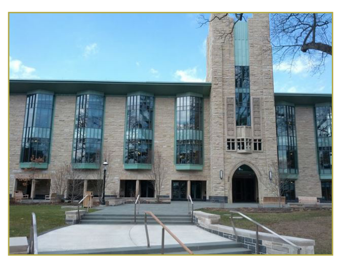
Princeton Theological Seminary, Princeton, NJ

Want to be showcased in the next newsletter? Post a photo of your library with #ATLAlibrary.