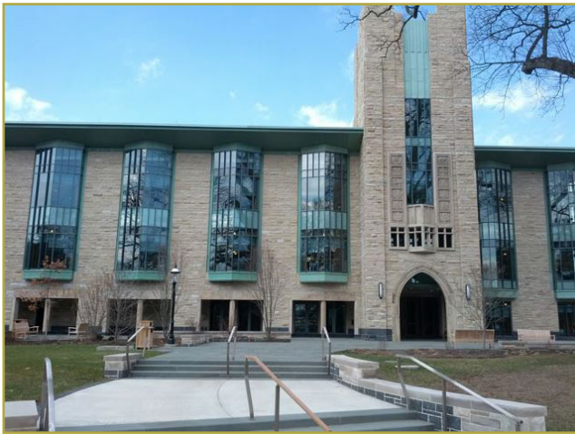
Princeton Theological Seminary, Princeton, NJ

Want to be showcased in the next newsletter? Post a photo of your library with #ATLALibrary.