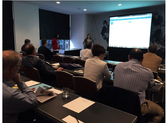
ATLA Products - Hands-On User-Session

The American Academy of Religion (AAR) and Society of Biblical Literature (SBL) Annual Meetings were held in San Diego, November 22-25. ATLA staff hosted an exhibit booth to engage attendees regarding our products, initiatives and membership options. We also offered two hands-on user-sessions, which provided personal instruction on searching ATLA databases using various functions and features. As in previous years, ATLA also hosted two receptions, including an evening soiree at the Hard Rock Hotel and a breakfast as Buster's Beach House on the marina.