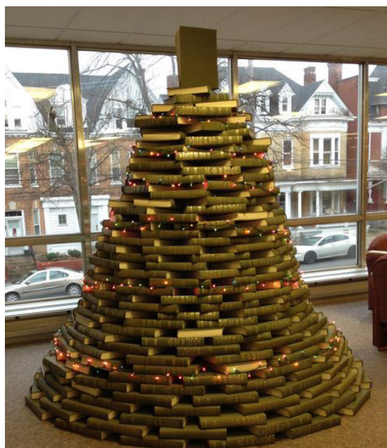
Schaff Library, Lancaster Theological Seminary, Lancaster, PA, celebrates the Christmas Holiday with a festive tree using our favorite items!

Want to be showcased in the next newsletter? Post a photo of your library with #ATLALibrary.