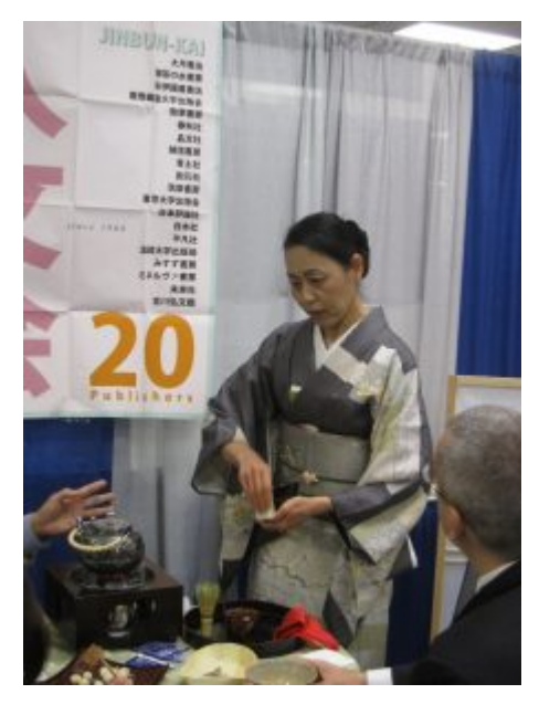
A moment of grace and elegance in the Japanese art of tea serving at the AAS 2018