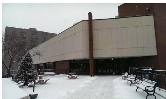
Gumberg Library, Duquesne University at Pittsburgh, PA.

Want to be showcased in the next newsletter? Post a photo of your library with #ATLAlibrary.