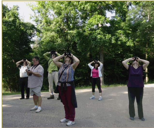
The group bird watching in New Orleans, LA.