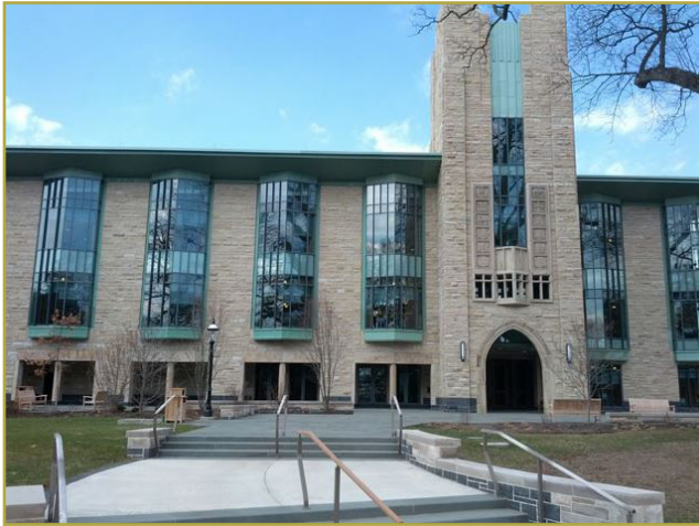
Princeton Theological Seminary, Princeton, NJ

Want to be showcased in the next newsletter? Post a photo of your library with #ATLALibrary.