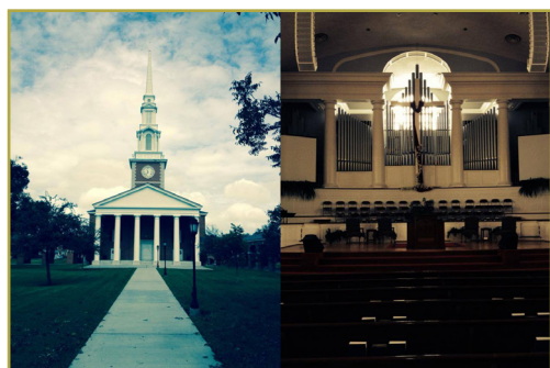
New Orleans Baptist Theological Seminary, New Orleans, LA.