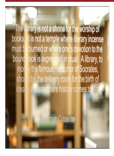
Photo from the Periodicals Area (from the Vanderbilt Divinity Library Renovation Project, May - August, 2006)