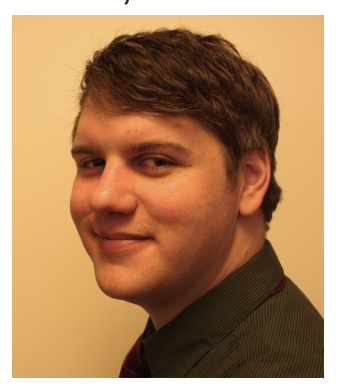
Institution: Student at Dominican University GSLIS