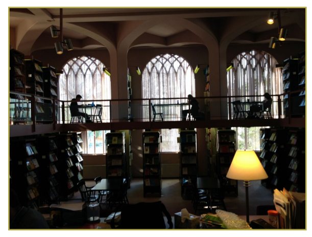
Pitts Theology Library at Emory University, Atlanta, Georgia