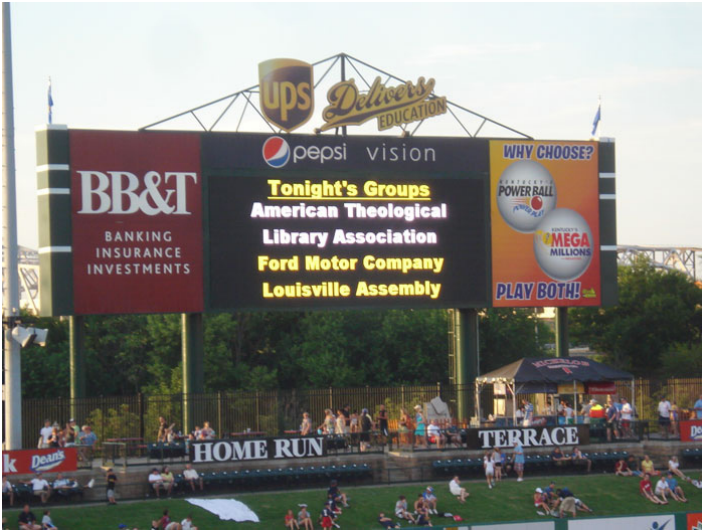
ATLA is officially welcomed to Louisville on the Bats scoreboard during the 2010 Annual Conference.